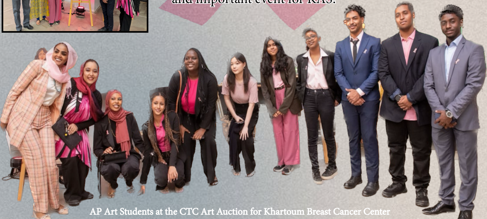
AP Art Students at the CTC Art Auction for Khartoum Breast Cancer Center